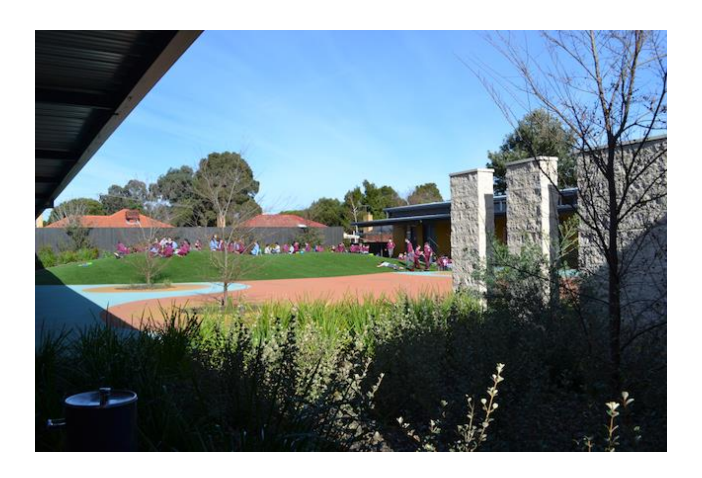
The current playground facilities at St Luke's school.