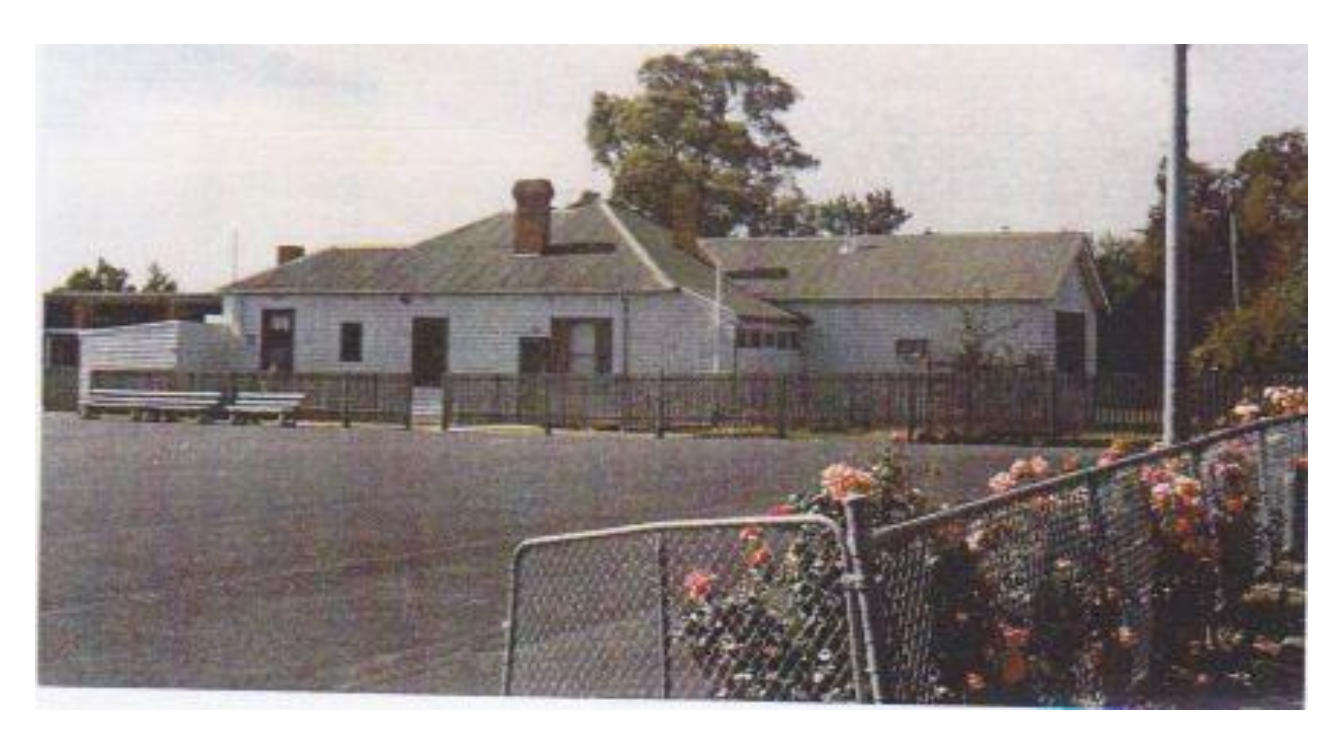
The original presbytery, an old farmhouse circa 1970s.