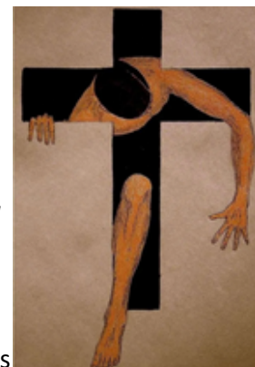
The Cross, the Narrow Way by David Hayward, 2002 © David Hayward, all rights reserved

© 2025 Servants of the Word, Don Schwager