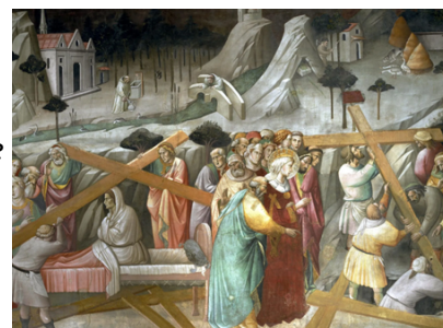
The Finding and Trial of the Three Crosses by Agnolo Gaddi (1369-1396), Fresco painting

Meditation: Do you know the healing transforming power of the cross of Jesus Christ? The Lord Jesus came to unite earth with heaven and to raise those on earth to the glory of heaven. Jesus explains to Nicodemus, one of the chief leaders of the Jewish nation, that he is the "Son of Man" sent by the Father in heaven to restore our broken relationship with God. The "Son of Man" is a key Old Testament title for the Messiah who comes from heaven to establish God's kingdom on the earth (see the prophecy of Daniel 7:13-14).