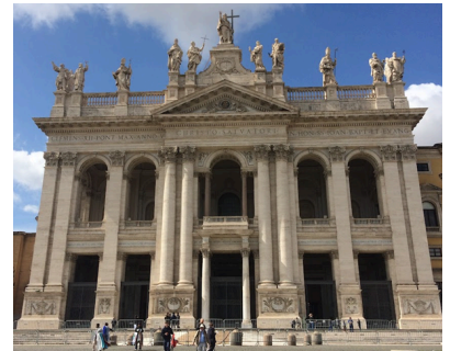
Façade of the Archbasilica of Saint John Lateran, façade built in 1735 by Alessandro Galilei

The Lord Jesus makes us temples of the Holy Spirit: Through his death and resurrection, Jesus not only reconciles us with God, he fills us with his Holy Spirit and makes us temples of the living God (1 Corinthians 6:19-20). God's word enlightens our minds and purifies our hearts that we may offer God fitting worship and enjoy his presence both now and forever. Do you burn with zeal for the Lord's house?